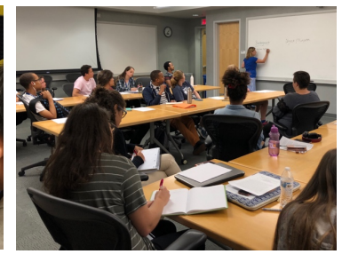
Participate in Skill- Building Workshops